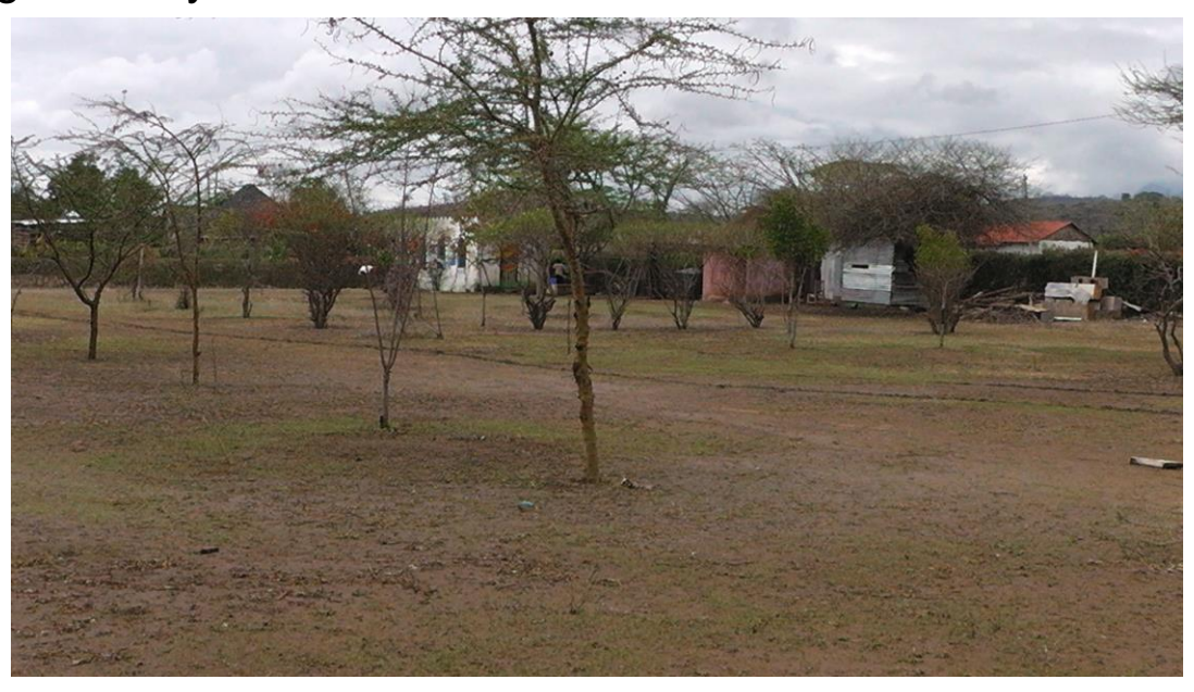
Photo showing rain-deprived environment of Heshima, but with many fruit trees surviving

As for the site itself, our caretaker Kasioki continues to play a major part in developing a pleasant environment for all, including planting and nurturing a variety of fruit trees.